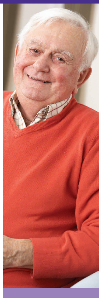
The Clinical Roundtable was established to improve medical care for those suffering from Alzheimer's.

The goal of the group is to develop a consensus on how to screen for, diagnose and treat Alzheimer's disease and other dementias. Three subcommittees have been created to accomplish this, including a team focused on creating standards of practice for diagnostic criteria and workup, a second team working on standards of practice for disease management and mental health, and a third team focused on healthcare provider education and outreach. Rather than formulating recommendations, the Clinical Roundtable will present a progress report at the December 2014 Board Conference.